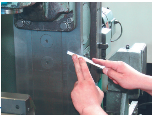
Retouching of machine slide

The perfect combination of ceramic grains and rubber binder avoids any problems of jamming and clogging. These abrasives can work as well dry or lubricated.